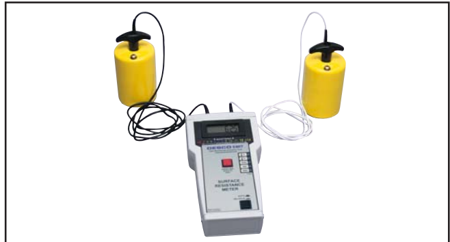
Figure 4. Setting up for RTT testing.

If measurement is outside acceptable limits, clean surface & retest to determine if cause of failure is insulative dirt layer or the ESD protective product. Note: Use an ESD cleaner containing no insulative silicone (i.e. Reztore™ Antistatic Surface and Mat Cleaner)